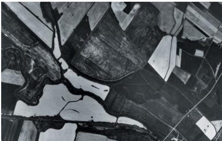
Fig. 1. The site in 2000 with a predominance of agricultural land and fields