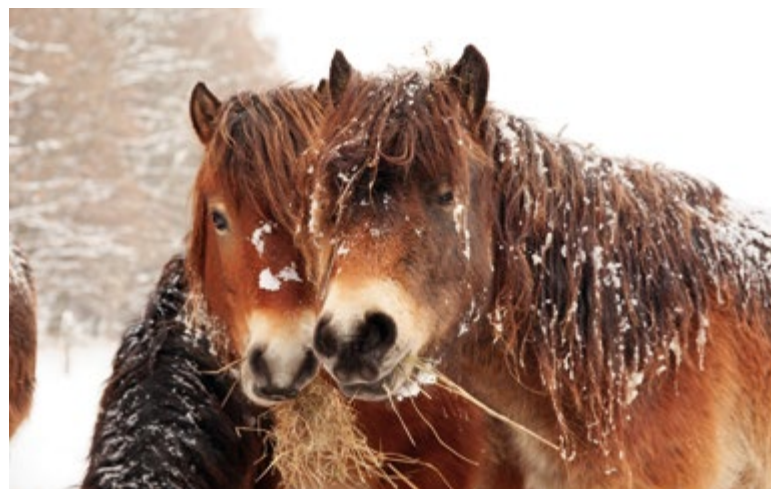
Fig. 6. ... as well as very resilient and undemanding