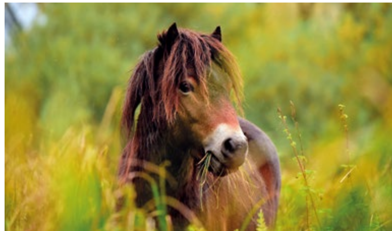
Fig. 5. The Exmoor pony is a beautiful animal...

that would dominate without grazing) and disturbance of the soil by hooves, which increases species diversity of the herb layer during periodic waterlogging of the site. Another positive effect of the presence of wild horses is the “protective factor” for bird species; waders in particular seek their presence and are much calmer than usual. This general tendency was also manifested in the area of Kozmice bird meadows, where there is a stable population of northern lapwing