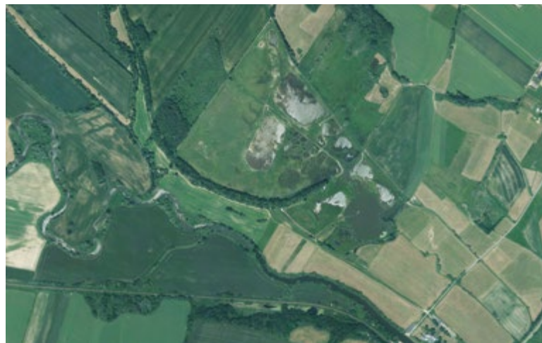
Fig. 2. The site nowadays with wetlands and water bodies