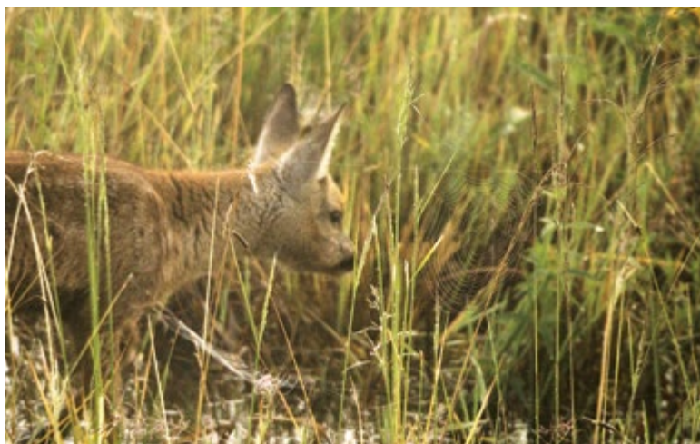
Fig. 3. A young roe deer is discovering the world