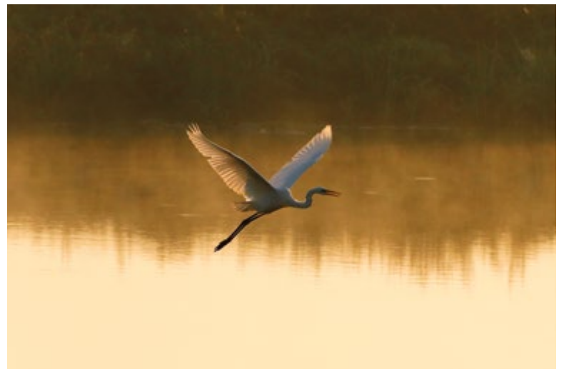
Fig. 10. Great egret in the morning sun rays