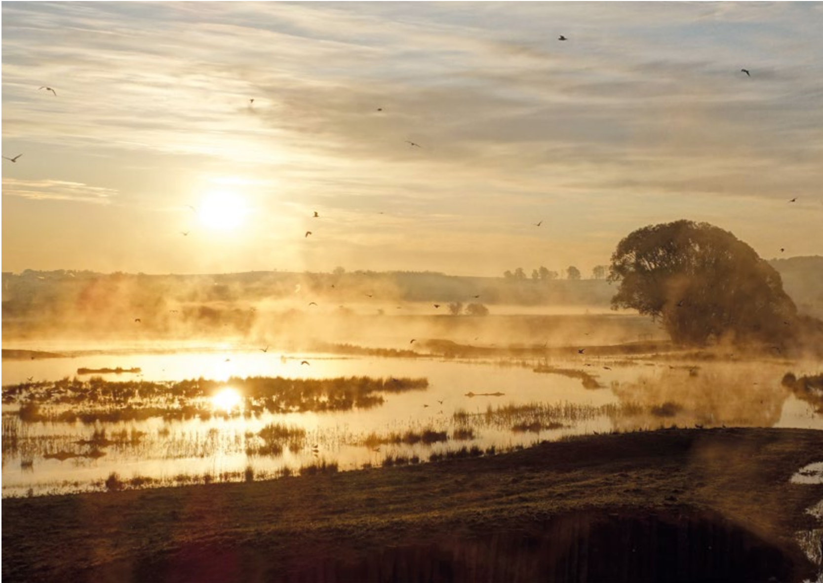
Fig. 8. Morning sun over Kozmice bird meadows