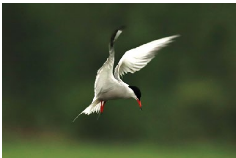
Fig. 11. Common tern

ISSN 0322-8916/© 2023 The Author(s). This is an open access article under the CC BY-NC 4.0 licence.