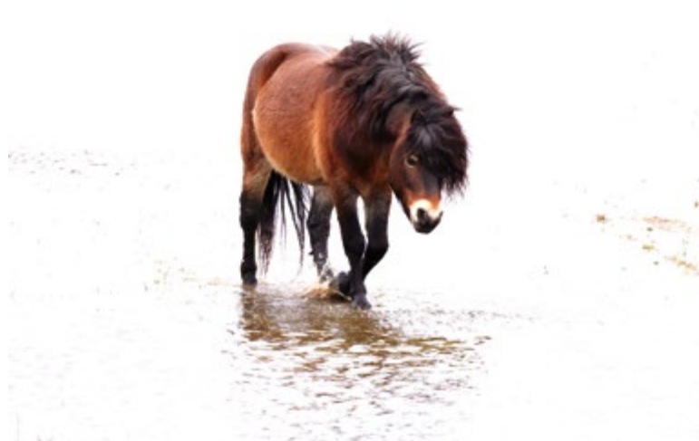
Fig. 7. It is used to water and is connected with water