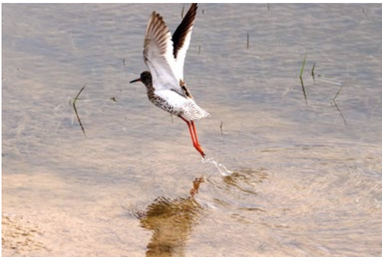
Fig. 9. Common redshankredshank